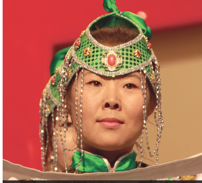
A woman wearing the Inner Mongolian traditional costume during an earlier celebration of the New Testament translation into their minority language. Your kind giving means the whole Bible will soon be published.

'Due to the spread of the gospel, believers have been freed from such superstitious practices. But there are still many who do not yet know God. Through God's word they can be saved.'