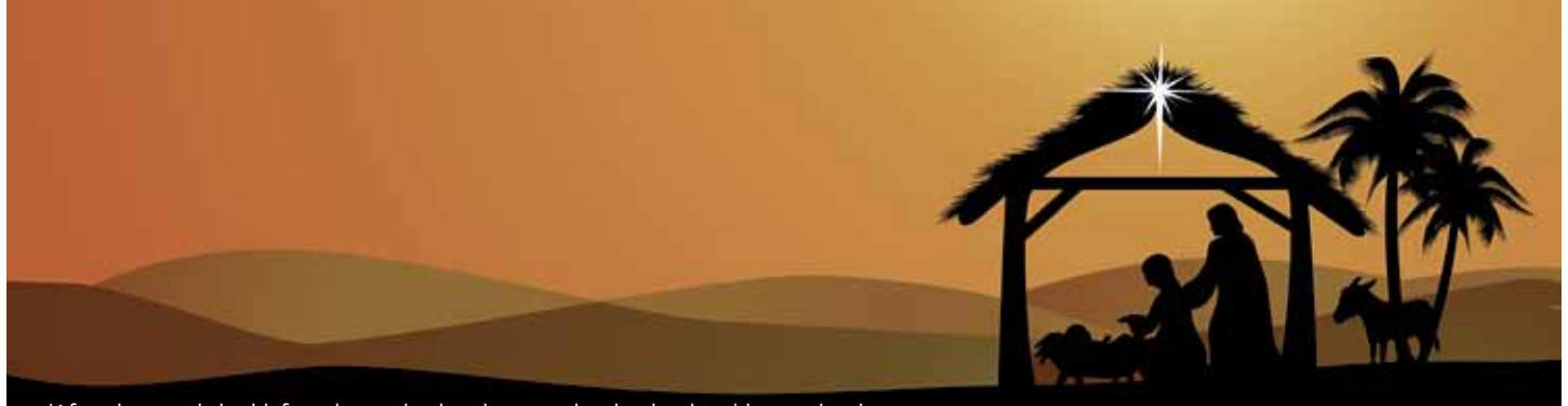
'After the angels had left and gone back to heaven, the shepherds said to each other, "Let's go to Bethlehem and see what the Lord has told us about." Luke 2.15 (CEV)