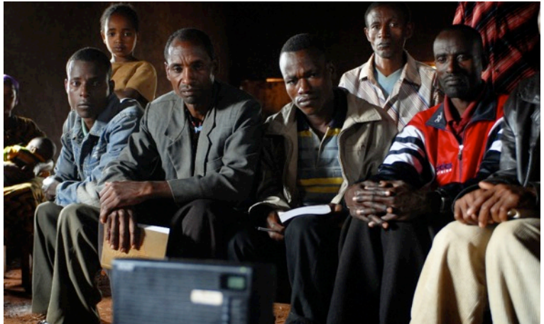
Men gather round the Proclaimer for their weekly listening group

Formal education did not become standard in Ethiopia until the 1970s, so anyone over the age of 40 is likely to be illiterate. In rural villages, where communities live through subsistence farming, the illiteracy rate is likely to be very high.