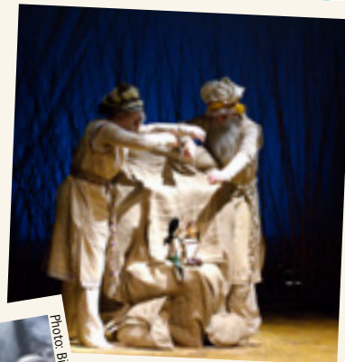
No Nonsense Theatre perform their Bible Society backed adaptation of the Book of Ruth