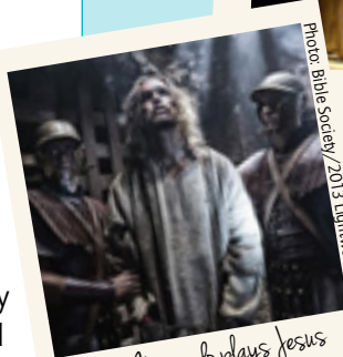
Diogo Morgado plays Jesus in The Bible tv miniseries