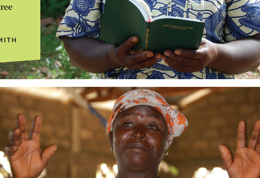
Christians who speak Kabiye love the New Testament and they're longing to read the Old Testament in their language.

Mali is Muslim-majority, has low levels of literacy and a very young