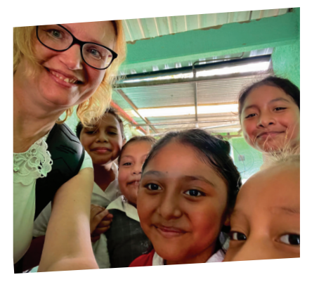
Head of Supporter Relations I am always aware of the LORD's presence; he is near, and nothing can shake me. And so I am thankful and glad, and I feel completely secure. (Psalm 16.8-9, GNB)