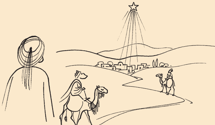
"The same star... went ahead of them" (2.9-10)

7 So Herod called the visitors from the east to a secret meeting and found out from them the exact time the star had appeared.